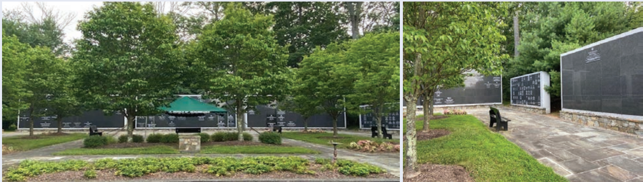
Court of Abraham Mausoleums and Columbariums

In the tradition of our ancestors Abraham and Sarah, Gan Zikaron offers Mausoleums and Columbariums for the above-ground entombment of loved ones in our Court of Abraham and our new Court of Sarah. Eternal crypts and niches offer eternal resting places in the tradition of our ancestors, Abraham and Sarah.